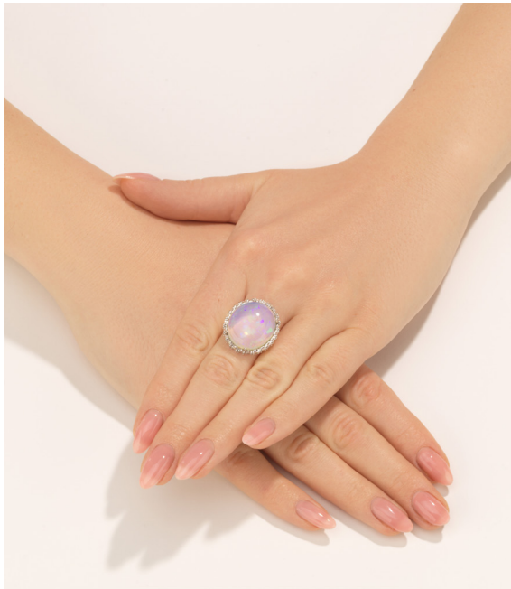
14.40 carats Ethiopian Opal. Set with 1.66 carat rose cut Diamonds