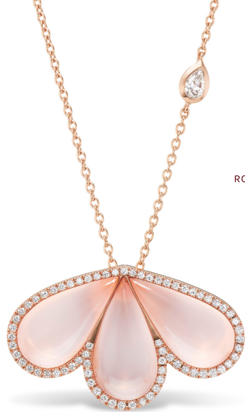
ROSE PETAL EARRING AND NECKLACE SET